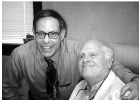
Continued from page 4

of collaborating with a person having training and interests such as mine—a pediatric neurologist with a knowledge of the medical aspects of neuro-oncology. We combined our efforts initially at a distance and eventually as partners and remained close friends, as well, for over 25 years. We first shared